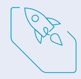
Innovative Startups and Entrepreneurs