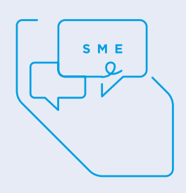
Small & medium-sized companies